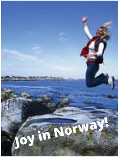
Joy in Norway!